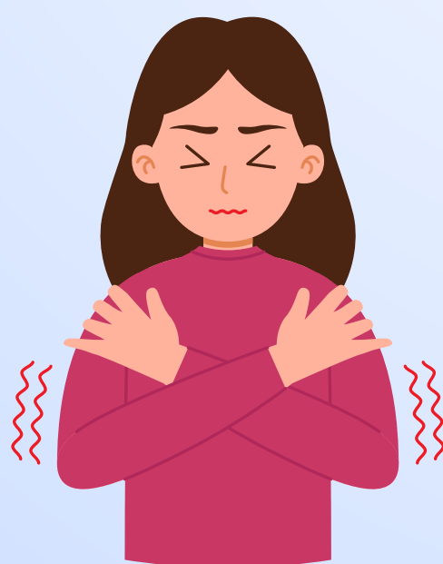
Tenderness or sensitivity to touch around a joint