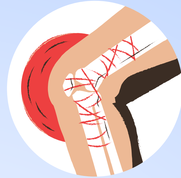
Stiffness or reduced range of motion