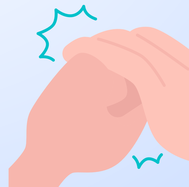
Cracking or popping sounds when moving the joints