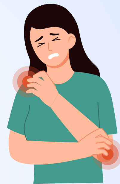
A feeling of heat or warmth and skin discoloration near your joints